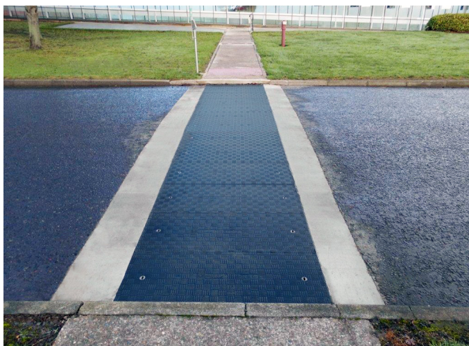
Fibrelite lightweight access covers are designed to withstand heavy loads and harsh weather conditions