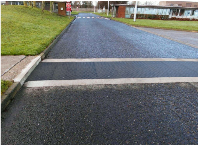
Fibrelite GRP access covers installed at pharmaceutical facility in Northumberland, UK