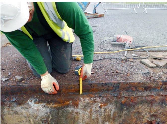
Previously installed heavily corroded access covers

Accessing the service trench was a time-consuming task which required specialist workers and equipment. The previously installed covers were a mixture of heavy solid concrete units and sheets of metal. The sheets of metal were installed at a later stage to patch over the heavily corroded concrete units. A drill was required for removal and replacement of the initial covers, when removed the concrete covers fragmented and broke apart. The metal sheets had become bent and misshapen especially around the edges and caused a major slip hazard when wet.