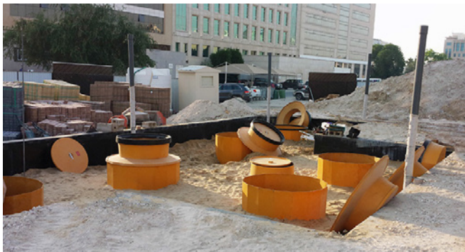
Fibrelite S14-390 tank sumps under installation

Fibrelite has been awarded sole supplier status by a Qatari oil company for tank and dispenser sumps with pipe and cable sealing kits to withstand the tough local climate and installation conditions.