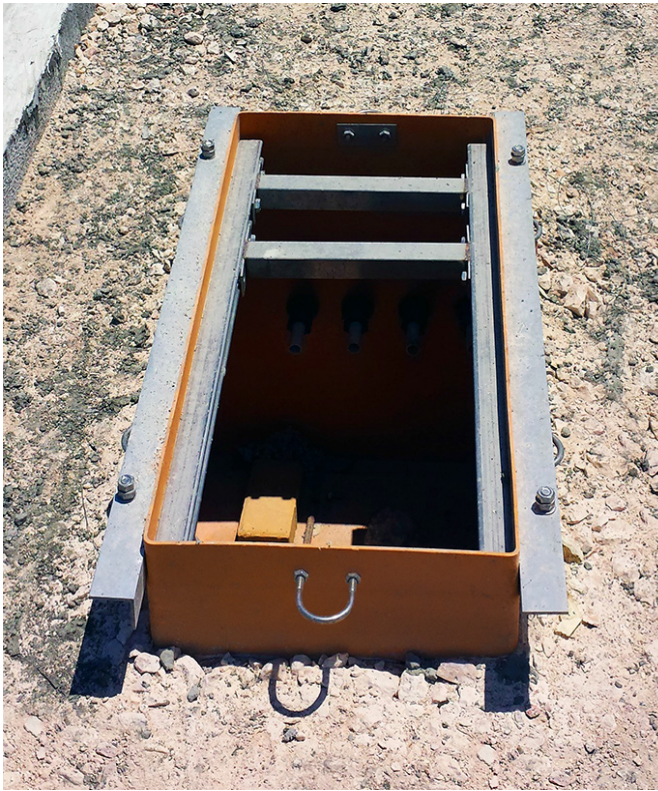
All Fibrelite sumps are vacuum testable during and after installation