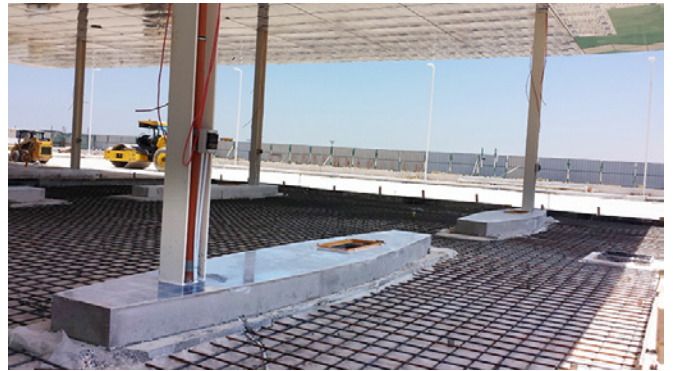
Fibrelite dispenser sumps are highly effective at preventing water ingress