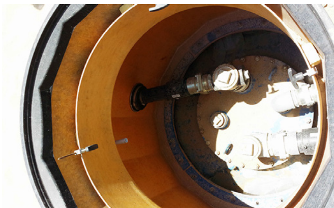
Vacuum testable Fibrelite pipe seal kits form watertight seal