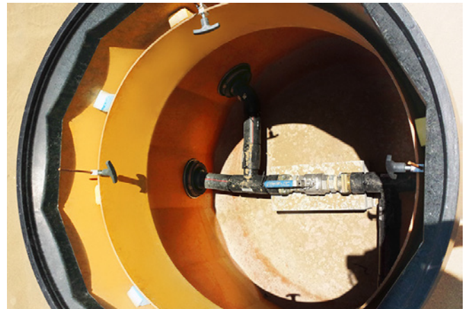
Fibrelite pipe entry seal kits are easy to install, vacuum testable and flexible to allow for ground and pipework movement

Water ingress issues had also been a problem at locations near the coast due to the high pressure of the surrounding water table on the enclosures and a highly corrosive environment.