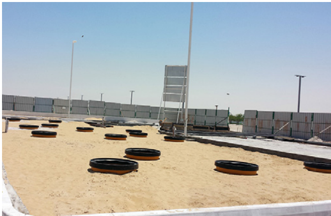
Fibrelite tank and dispenser sumps specified by Qatari oil company