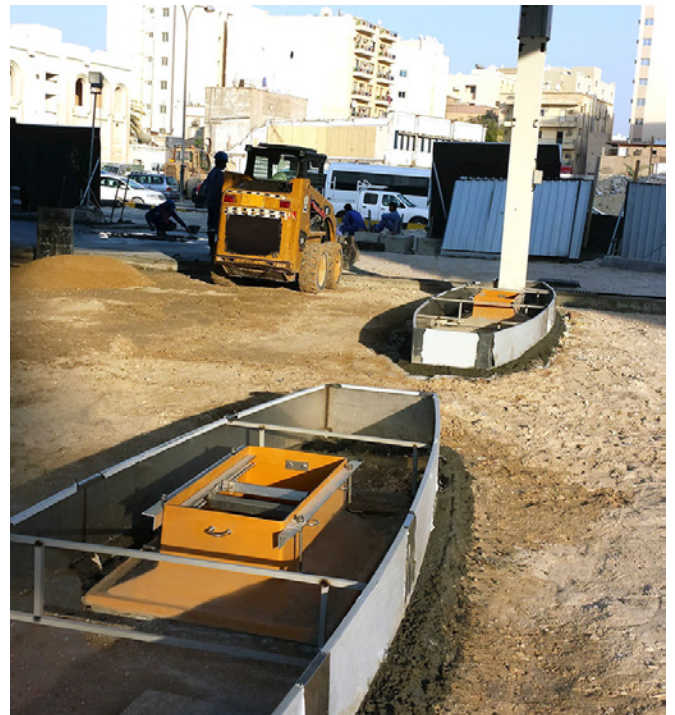
Fibrelite EL-G-E500 dispenser sumps ready for concreting