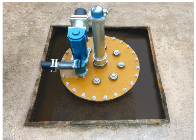
OPW's Fibrelite team came up with a solution to chemically bond the GRP square chambers onto the old tank upstands