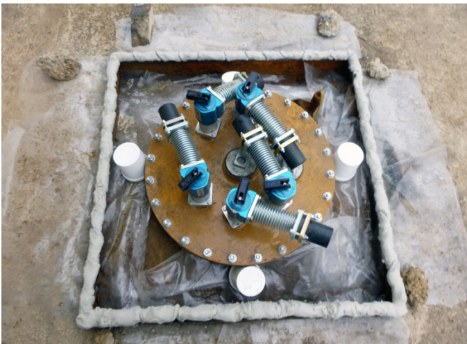
Preparation of surface for putty

The site team conducted a vacuum test onsite after the install to ensure water tightness of the chambers.