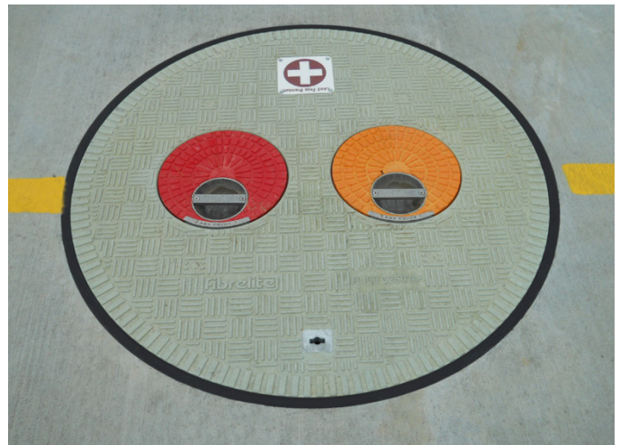
Fibrelite's 40" (1020mm) multiport with color coded easily removable, watertight fill / vapor ports