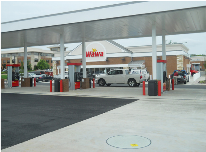
New WAWA site in Pennsylvania