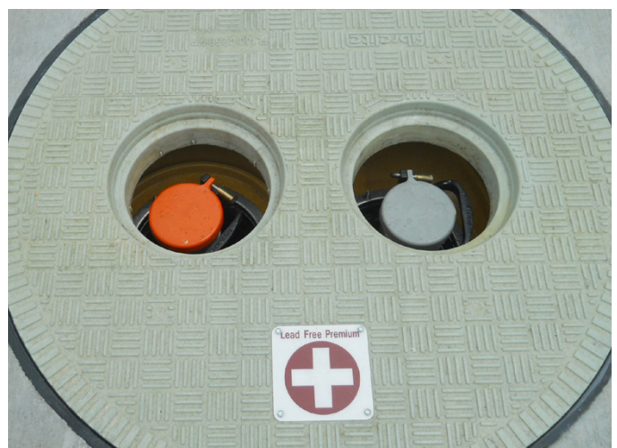
Easily removable port covers