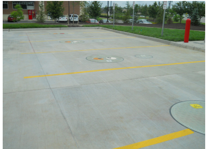
Fibrelite's 40" (1020mm) sealed multiport direct fill covers and 18" (180mm) monitoring well covers