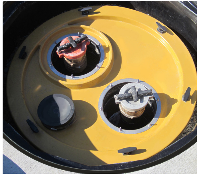
Fibrelite structural spill platform

For more information on the OPW product range please contact us: