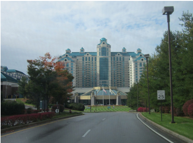
US Premier Retail Petroleum Facility