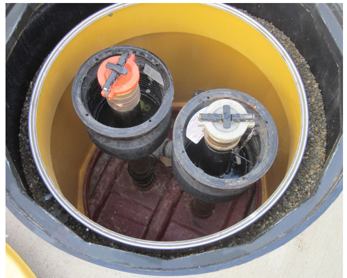
Fibrelite Fill sumps