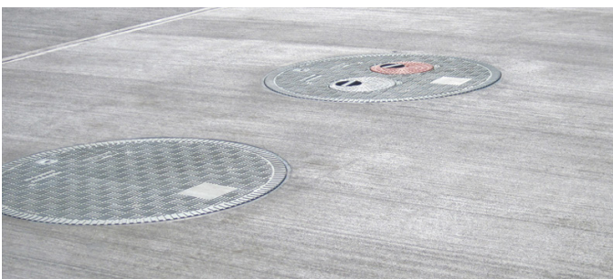
Tank Pad showing FL100-MP Fibrelite Multiport Cover and FL100 Cover

While designing the underground storage tank and piping system for the site, the architects chosen by the Mashantucket Pequots requested that the "best of the best" products be used throughout the system. Fibrelite's local distributor, Wildco, Inc., recommended that the architects specify Fibrelite fill sumps, tank sumps and manhole covers for the tank top area.