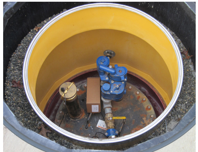
Fibrelite Turbine sumps

Fibrelite's 40" watertight multiport direct fill covers and 40" composite covers are lightweight, durable and very strong. The covers include "multi-wiper" gaskets that ensure a watertight seal. Every Fibrelite cover is manufactured using high-technology RTM production methods to create a highly engineered, monolithic GRP composite product. Fibrelite's tank sumps are also designed using high-tech vacuum-assisted moulding production methods and are factory-tested under vacuum to ensure they will be watertight.