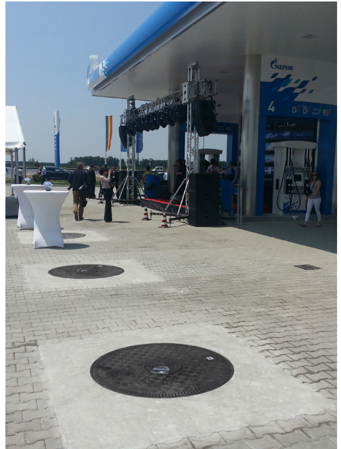
Fibrelite's FL100/CD cover. The central dip cover makes it easy to access the riser without having to remove the whole cover

Fibrelite's wide range of dispenser sumps offers a great alternative to polyethylene sumps. The strong rigid structure will not deflect under groundwater pressure. The simple two piece design provides a large working space to install pipework inside the sump before the top section is installed.