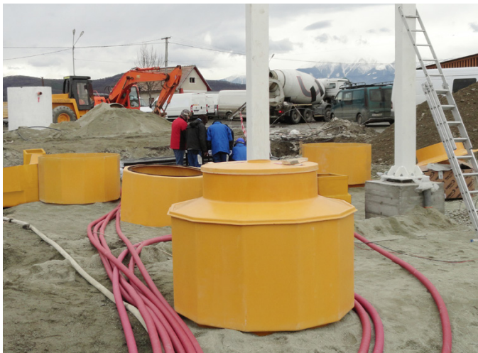
The GRP chambers are fully adjustable to accommodate shallow tank burial depths

Fibrelite's lightweight, watertight manhole covers and tank sumps have been specified by Gazprom in Romania.