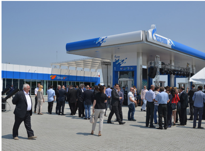
Grand opening of NIS Gazprom Neft's new Petrol station in Romania