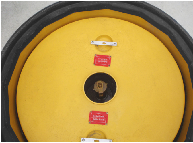
Fibrelite's tank sump with central dip internal lid