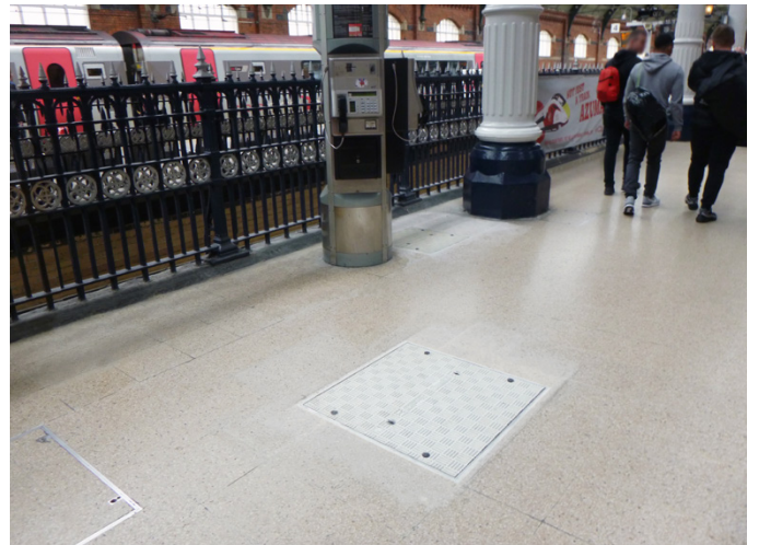
Fibrelite supplied covers which matched the base colour of the tiles

Colt Construction provided a sample of the flooring, enabling Fibrelite to supply covers which matched the base colour of the tiles. The B125 load rated covers were bolted down, preventing unauthorised access. The anti-slip surface of the covers provides a safe walking surface for station users, installation was completed within the tight timeline.