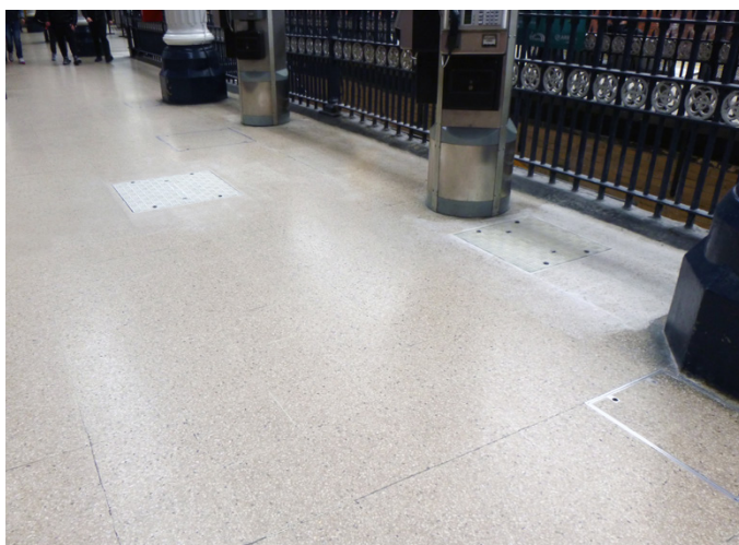
Fibrelite covers provide a safe walking surface for station users

Colt Construction were looking to upgrade the broken and damaged recessed covers which had become difficult to remove and replace for maintenance purposes. Darlington railway station is a listed building which meant that the covers needed to match the surrounding floor tiles, whilst preventing unauthorised access and providing a safe walking surface for station users.