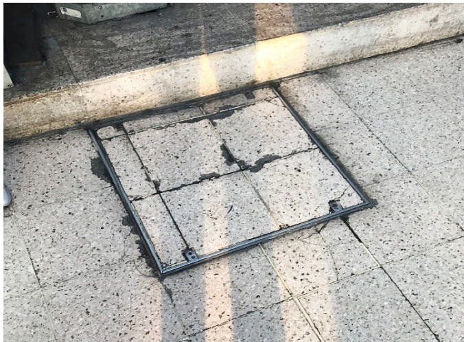
Colt construction were carrying out a platform upgrade programme

As part of a platform upgrade programme, Colt Construction (Principle Contractors) approached Fibrelite looking to replace and colour match Darlington railway stations broken and damaged recessed covers which provide access to electrical services, CCTV and telecommunication cables, within a tight timeline.