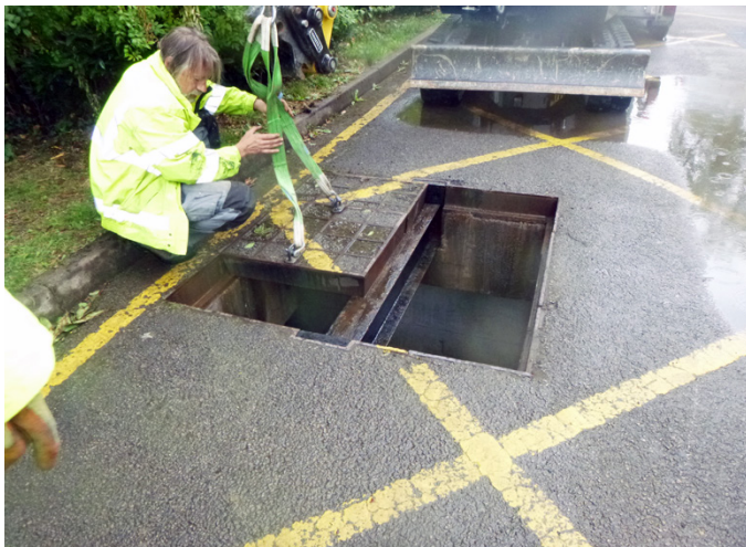
Due to the weight and difficulty in removing the covers critical time is lost in emergency situations