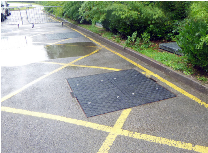
Fibrelite provided a selection of lightweight covers