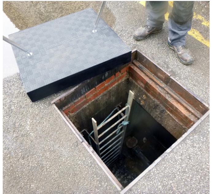
The covers provided access to underground water valves