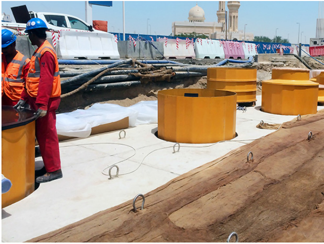
Fibrelite tank sump being vacuum tested on site