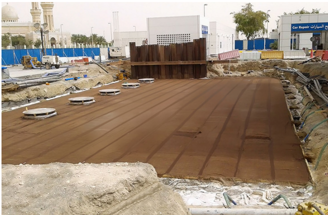
The deep installation required a robust corrosion resistant watertight solution