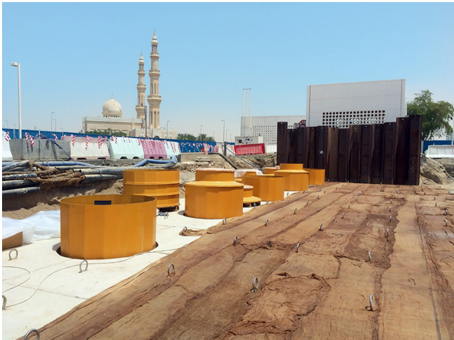
Fibrelite's vacuum testable tank sumps highly effective in preventing water ingress

The deep installation required a robust corrosion resistant watertight solution to withstand the high pressure of the surrounding tidal water table and highly corrosive environment.