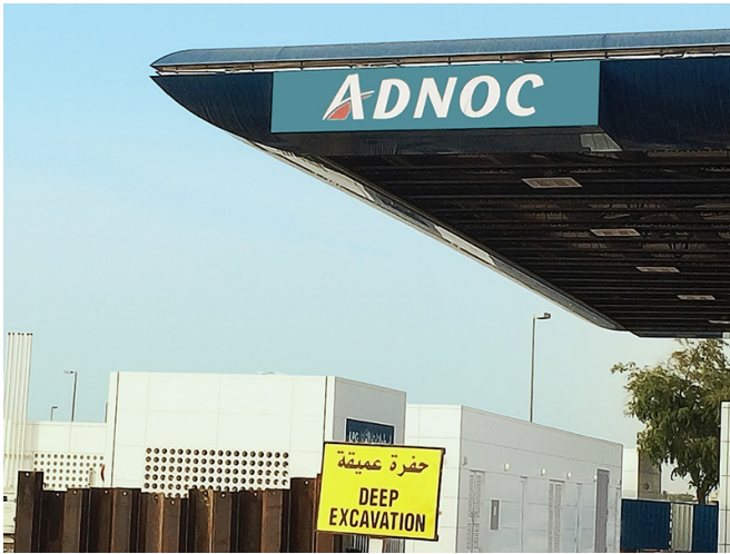
Fibrelite's lightweight, watertight manhole covers and GRP tank sumps have been specified by a leading oil company in the UAE