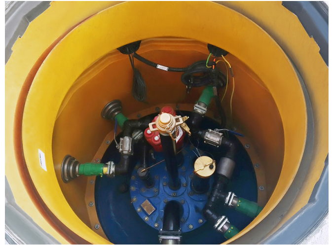
Fibrelite tank sump system with KPS pipework provides a best in class offering

Many installations have persistently high water tables and Fibrelite's vacuum testable tank sumps are highly effective in preventing water ingress and subsequent damage to equipment and possible water contamination to fuel.