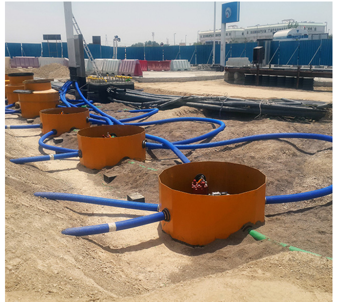
Fibrelite tank sump system with pipework attached using Fibrelite pipe entry seals, forming a watertight seal