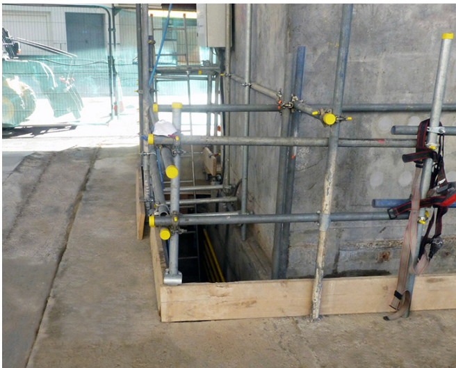
Spherical sliding bearings located in underground pits, allowing for minor movement of the pier