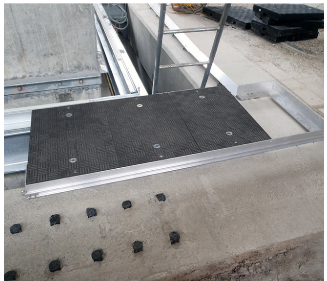
Lightweight tailor made Fibrelite covers set into frame around supporting pier

Handling pedestrian and vehicle traffic was achieved by supplying a C250 (25 tonne) load rated cover with a unique anti-slip/skid tread pattern surface.