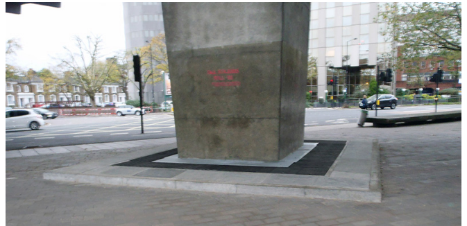
Roller bearings at the bases of supporting piers were replaced due to wear and increased load on the bridge

For more information on Fibrelite's product range please contact us: