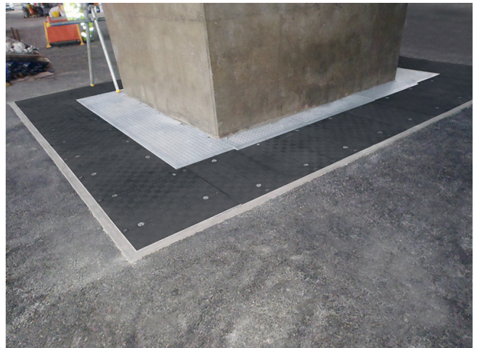
Replacement bearings located in the underground pits, covered by continuous set of access covers, allowing for the minor movement of the pier