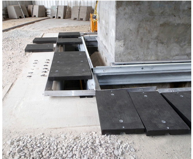
Bespoke composite trench covers designed with encapsulating frames