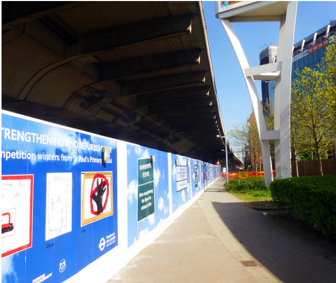
London Hammersmith flyover during

Fibrelite Trench Covers Provide an Engineered Covering Solution Over Bearing Pits for Iconic Hammersmith Flyover in London