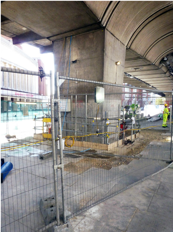
Roller bearings at bases of supporting piers before being replaced