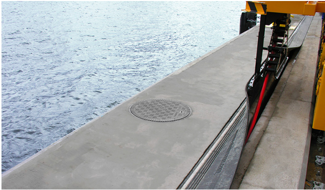
F900 load rated sealed cover over fresh water valve pit