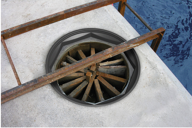
Composite frame over fresh water valve pit in concrete