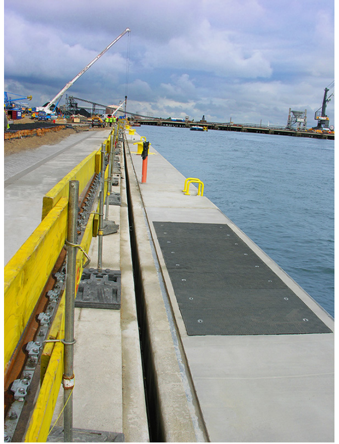
D400 load rated trench covers allowing safe manual removal