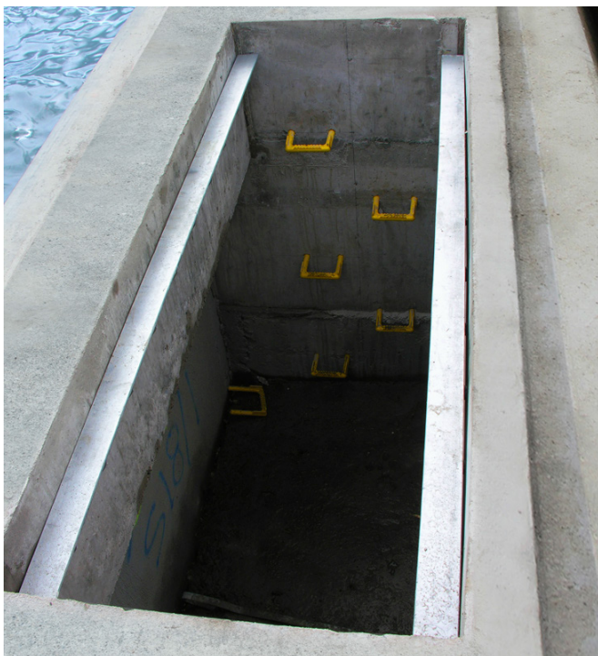
Access pit along edge of quay

As part of the extension of Container Terminal DCT Gdańsk (by construction company Besix) our Polish distributor Corrimex was approached to provide a strong, corrosion-resistant, easy to remove access solution.