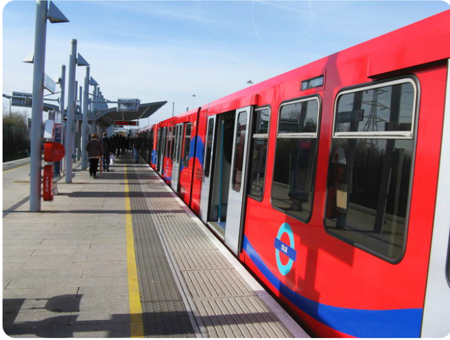
Railway Maintenance Depots

Fibrelite's bespoke lightweight composite trench covers have recently been installed over a service trench at the primary railway maintenance depot for the Docklands Light Railway. These were installed to give quick and easy access to the service trench.