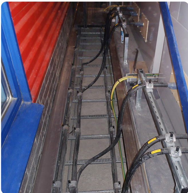
High and low voltage cables leaving trench to switchboard at regular intervals

Fibrelite had two major issues to deal with when installing and manufacturing the retrofit solution. Firstly, the concrete rebate was dimensionally inconsistent throughout, causing an undulating surface. Secondly, high and low voltage cables running through the trench also had to come out of the trench to the switch boards in various positions along the trench.