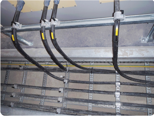
Expansive trench requiring coverage