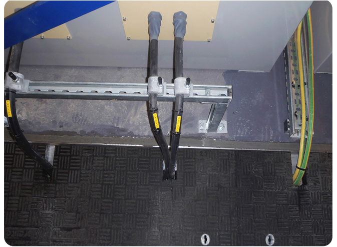
Custom made covers fit the trench and cabling entry points perfectly

For more information on Fibrelite's product range please contact us: