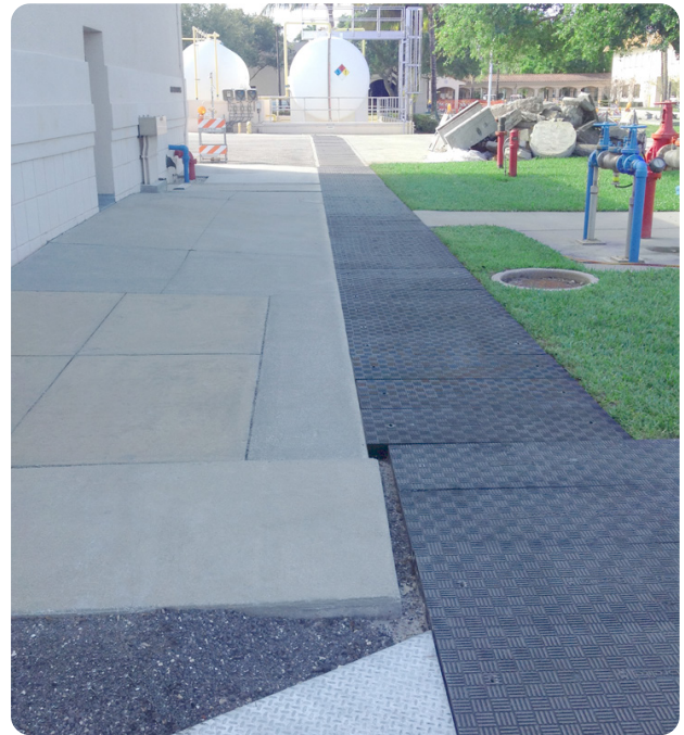
Perfect alternative to concrete

For more information on Fibrelite's product range please contact us: