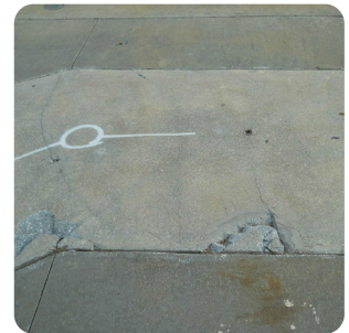
Traditional concrete panels are unsafe and labor intensive to remove and often break apart over time