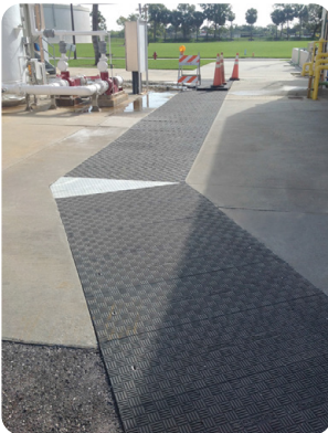
Lightweight composite trench covers