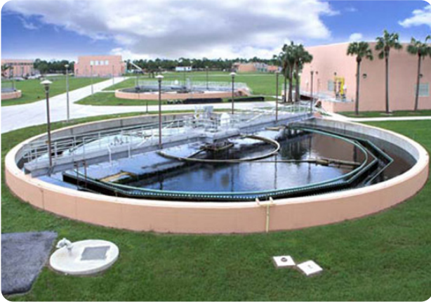
Concrete to Composites