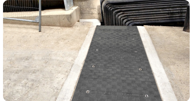
Fibrelite's trench covers available in various depths, widths and sizes

Fibrelite can provide to any requirement you may have, supplying the truly versatile trench cover