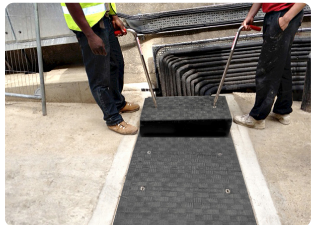
Fibrelite's ergonomically designed lifting handle make for easy and safe removal and entry to the ducting below

For more information on Fibrelite's product range please contact us: