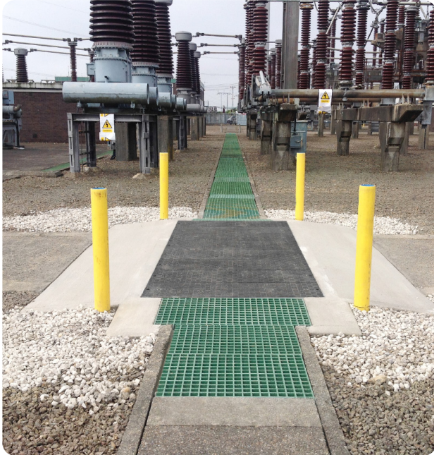
The installed Fibrelite heavy duty trench covers

Fibrelite's work replacing unsafe and damaged trenches at Sub-Stations continues. The Existing concrete and cast iron covers had begun to crumble and crack, causing health and safety issues on numerous sites. Trench covers manufactured by Fibrelite do not suffer from such structural issues and are maintenance free. Å