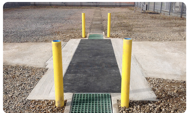
Lightweight composite trench covers

For more information on Fibrelite's product range please contact us: