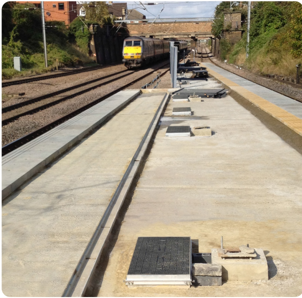
Section of train station platform with 4 covers (mid-way through install)

Fibrelite is in the process of supplying the first 20no. 900 x 450mm medium duty GRP composite covers for this large rail project. These lightweight covers will be used to provide easily access to electrical junction boxes and cable drawpits containing signalling equipment on the station platform.