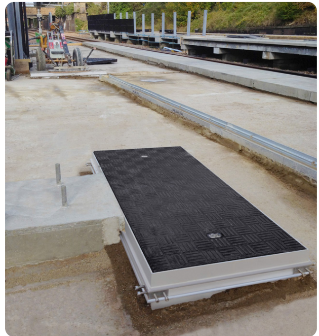
Fibrelite FM45-B125 trench cover

For more information on Fibrelite's product range please contact us: