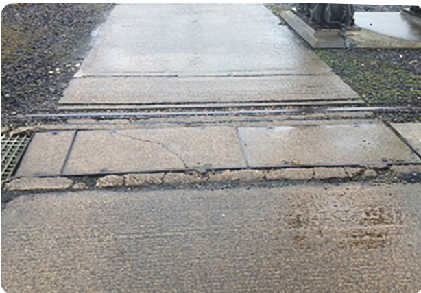
The previously installed cast iron frame showing signs of damage and corrosion