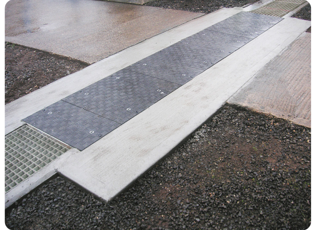
Fibrelite's trench covers are non-metallic, non-conductive and will not spark

This particular project required 800mm long trench covers which met the BS EN 124 D400 load rating. Fibrelite D400 load rated trench covers span from 800mm to 1600mm, meaning large span coverage can be achieved saving the customer time and money.