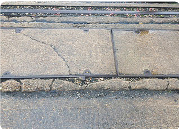
Previously installed corroded and damaged cast iron and concrete covers

Extremely heavy and damaged cast iron and concrete covers installed at the Sub-station caused a health and safety issue and needed replacing. Fibrelite's lightweight heavy duty composite trench covers were specified as the ideal solution. Designed as a 'fit and forget' product, the maintenance free trench covers provide easy and safe access to the electricity cables housed in the trench situated across the road.