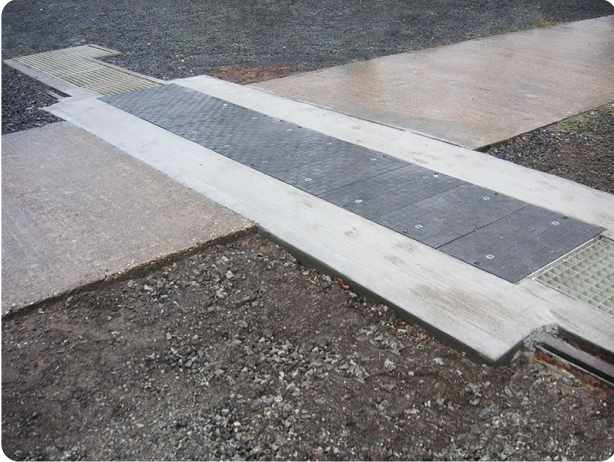
The Fibrelite D400 tonne load rated lightweight trench covers