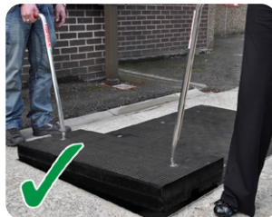
Safe lifting technique with Fibrelite Lifting aid

Customer Quote: "I was impressed with how easy the install was and couldn't believe how light the covers were whilst still being able to hold 40 tonne loadings."