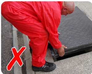
Dangerous lifting technique without Fibrelite lifting aid

The weight is kept close to the body preventing back injury: one of the main causes of absence from work and personal injury claims. The maximum weight of the largest panel is 25kg.