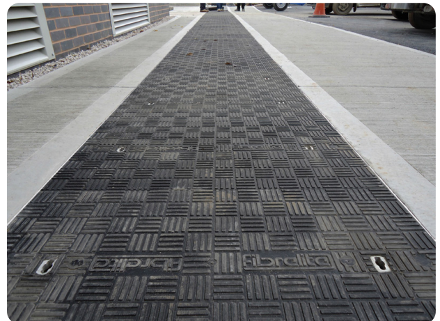
Fibrelite covers will not corrode or crumble like concrete or metal covers

Trench covers are a standard width of 450mm with a range of length options from 800mm to 1600mm. For larger areas of structural flooring, additional central support beams can be installed to extend the covering area.