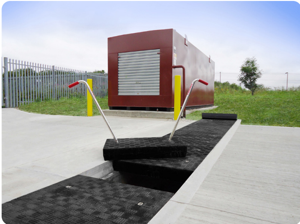
Fibrelite's FM45 trench access covers and FL7 easy lifting aid

Fibrelite has recently supplied an Airport 44 x FM45-80 trench covers (D400 load rating) with the encapsulating aluminium frame system. Fibrelite was specified by a leading firm of architects and the covers were installed by R&M Developments.