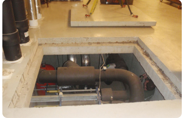
The geothermal monitoring pit